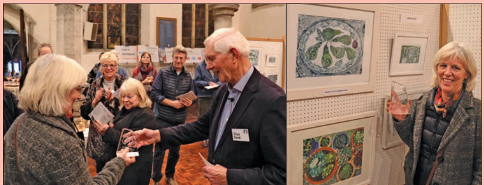
Chairman's prize awarded